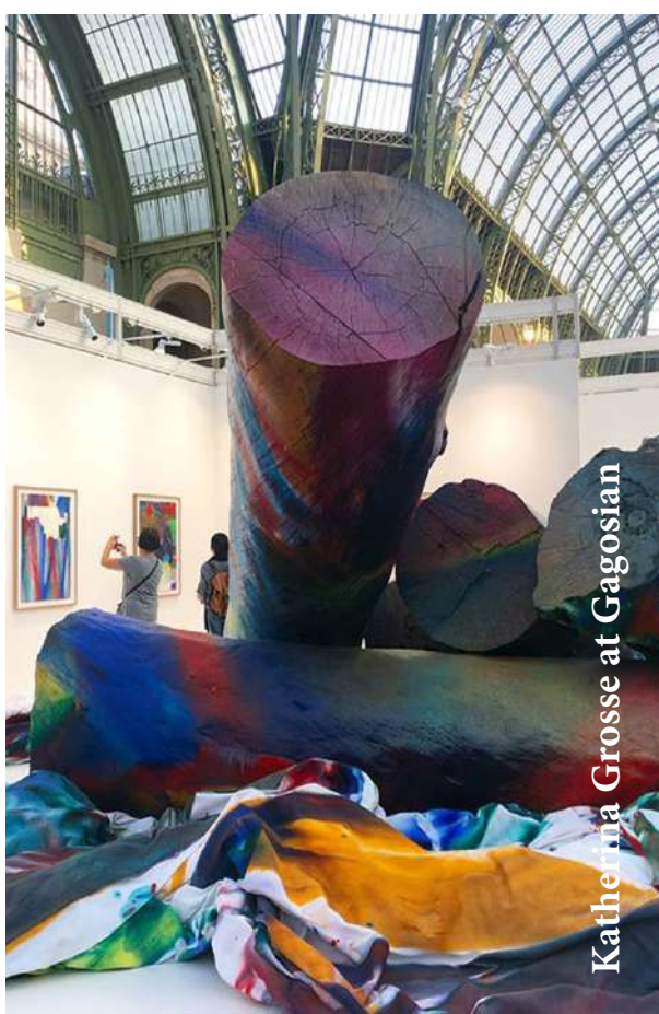
Katherina Grosse at Gagosian

We work side by side with artists and visual merchandisers to enhance and elevate their creative ideas using unique techniques and new technology, and the FIAC is always a rich source of inspiration for us.