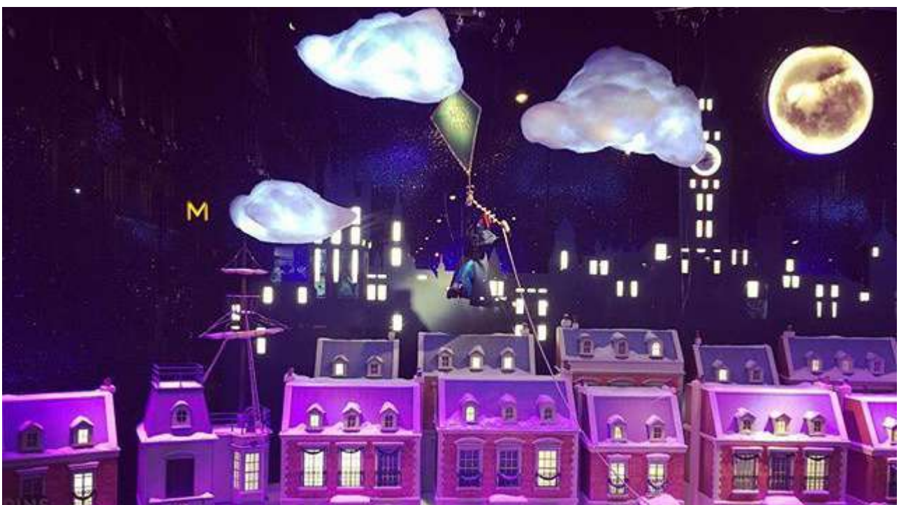
Top to Bottom : Le Bon Marché, Galeries Lafayette, Printemps & BHV