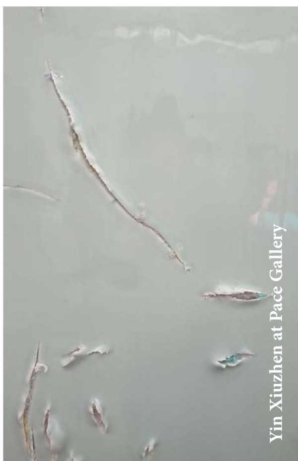
Yin Xiuzhen at Pace Gallery