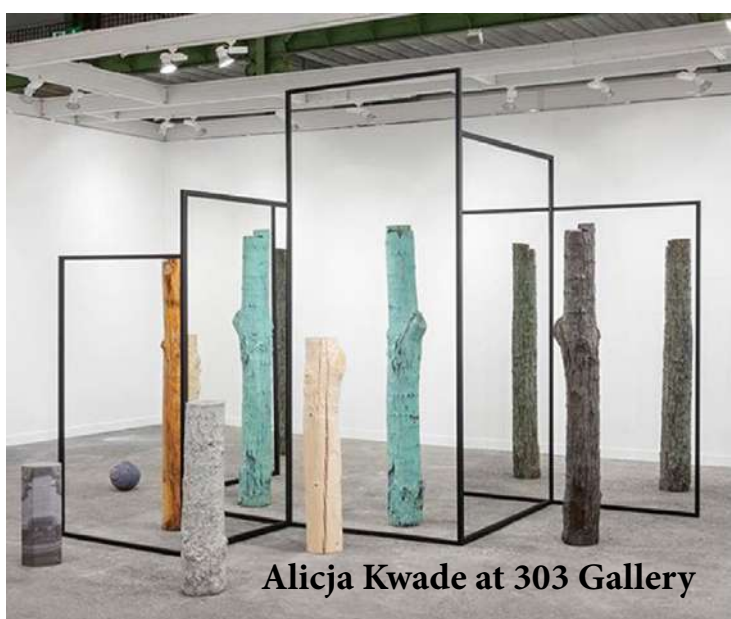
Alicja Kwade at 303 Gallery

American Supply attended the 45th edition of the FIAC, the internationally renowned contemporary art fair, at Paris' magnificent Grand Palais.