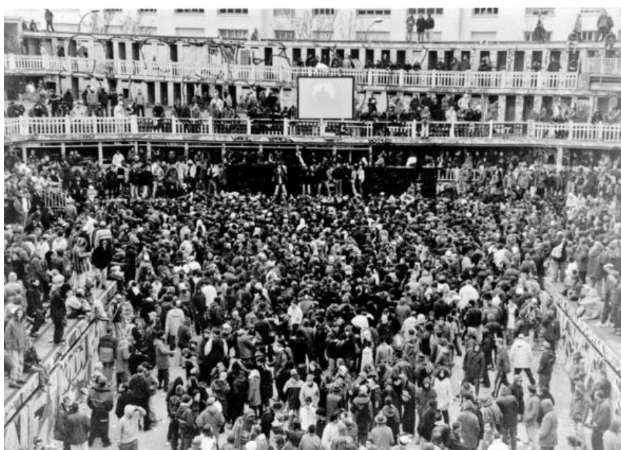
The infamous Heretik Sound System free party at Hôtel Molitor, Paris, 2001

Though the water is drained, this prismatic effect recalls its liquid light surface, bringing the sun itself to life. Enjoy the video above, courtesy of the Hôtel Molitor Instagram feed. (Source: https://www.instagram.com/mltrparis/ )