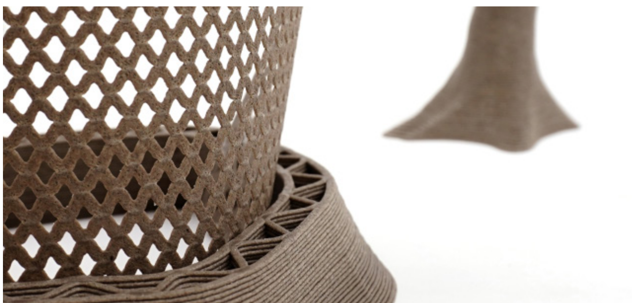
Several forms printed using a 3D printer using a mixture that incorporates 20% Ubiplast™ making the final printed product Climate Positive, in its neutral color

We have produced several tests using natural coloured pellets in a 3D printer, using a mixture that incorporates 20% Ubiplast™ making the final printed product Climate Positive, in its neutral colour. We have experimented making sculptural forms and a flexible mesh, which can then be sanded and painted in eco-friendly paints. These examples are just the tip of the iceberg of possibilities! With our 3D printing capabilities, we can produce sculptural elements for your projects up to 1.5 metres by 1.5 metres in size, making Ubiplast™ an eco-innovative choice for all luxury Merchandising and PLV.