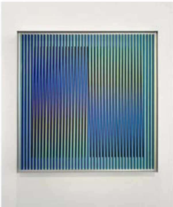
ART PARIS SEPTEMBER 2020 Carlos Cruz-Diez Galerie Wagner