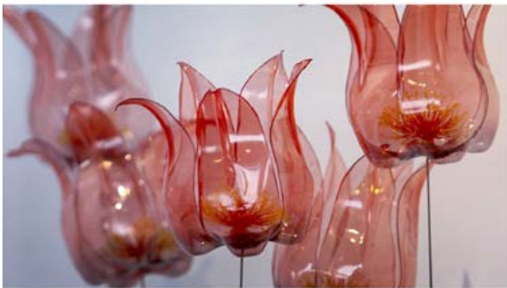
PARIS DESIGN W SEPTEMBER 2 WILLIAM AB FLOWERS MADE FROM PLASTIC WA