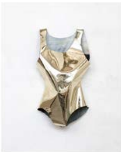
ART PARIS SEPTEMBER 2020 Mothilde Derize Galerie Pauline Pavée