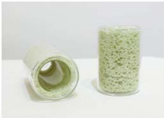
PARIS DESIGN W SEPTEMBER 2 STEVEN AKI GLASS FOAM COFFEE C