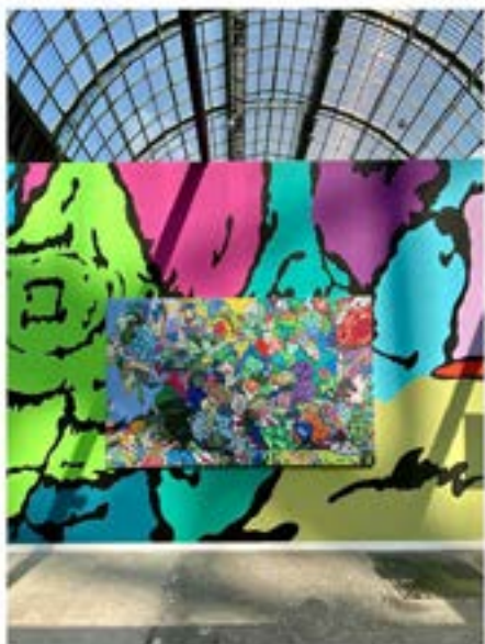
ART PARIS SEPTEMBER 2020 Louis Granet Gilles Drouault Galerie Multiple

Copyright © *2020* AMERICAN SUPPLY All rights Reserved The Material Journal is targeted at a professional audience