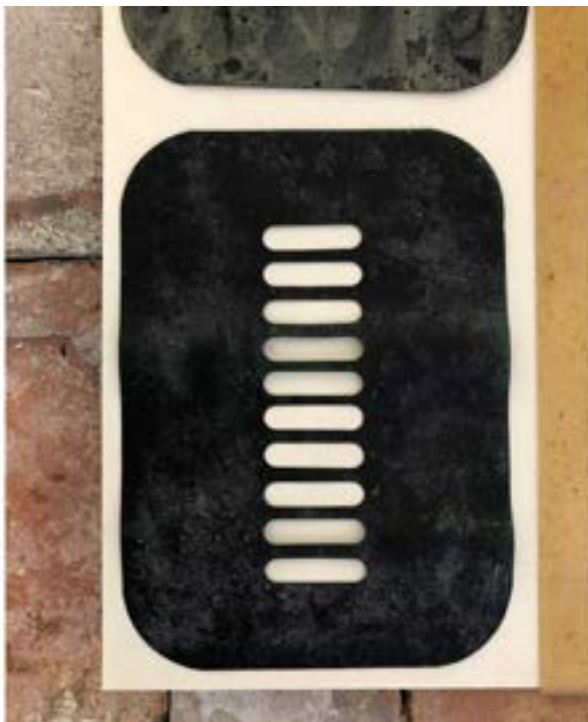
PARIS DESIGN WEEK SEPTEMBER 2020 SAMUEL TOMIATIS SEAWEED BASED MATERIALS