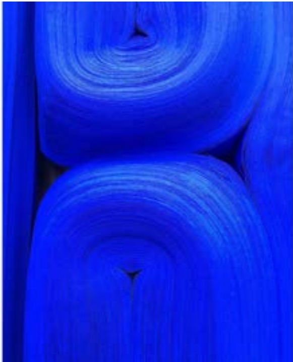
ART PARIS SEPTEMBER 2020 Jaeko Opera Gallery